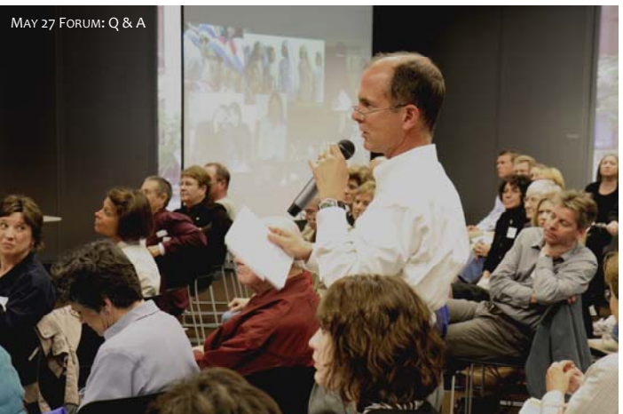
MAY 27 FORUM: Q & A